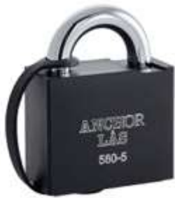
Available in Weather Protected version (WP)